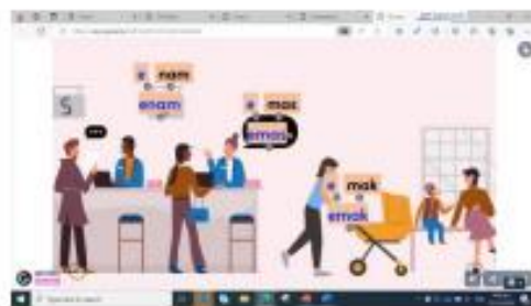
ML Digital Resource: Bridging Videos