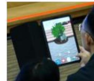
TL Digital Resource: AR Experience