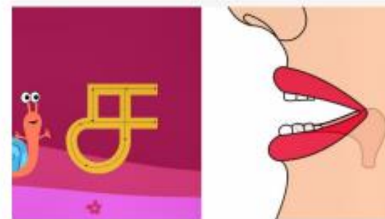
TL Digital Resource: Tongue Placement Videos