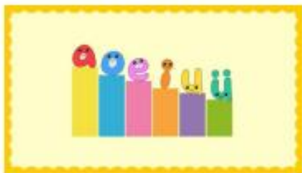
CL Digital Resource: Hanyu Pinyin Animation

Use of technology to sustain interest and encourage self-directed learning