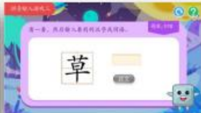
CL Digital Resource: Hanyu Pinyin Games